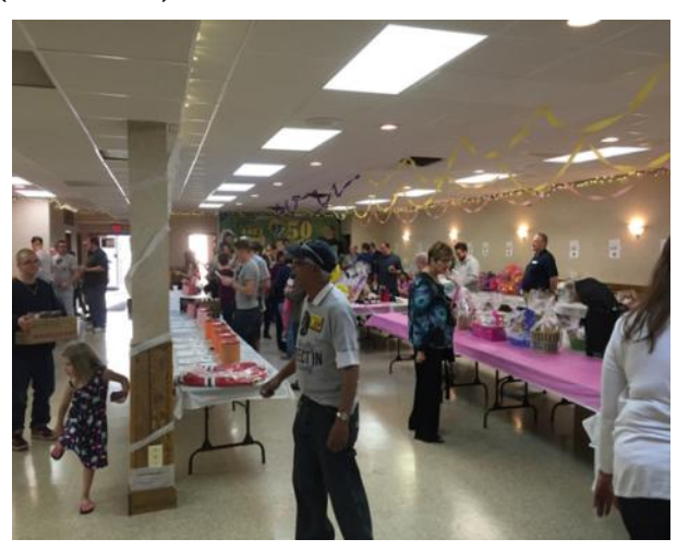
The Hall during the Event