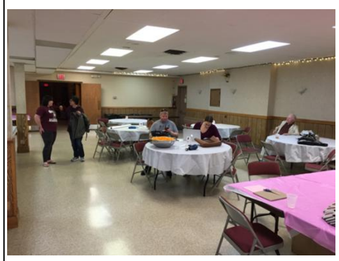
Organizing the Hall Eating Area, Pastry Tables & DJ Table.