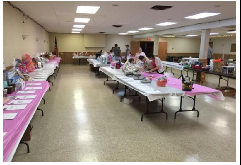
Organizing the Hall for Donated Items