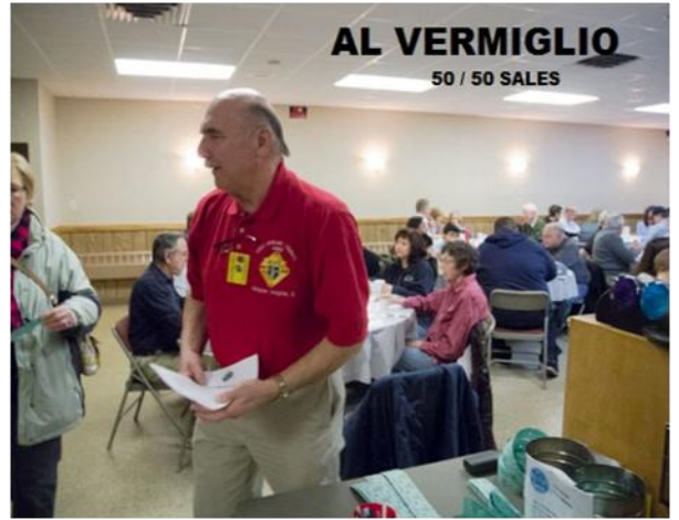
AL VERMIGLIO 50 / 50 SALES