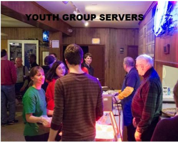
YOUTH GROUP SERVERS